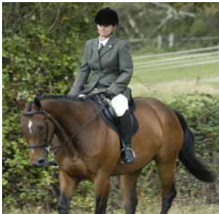
Genie again at Twynning Horse Show on 4 September, he was 4th in the racehorse class, 3rd in the sports horse class and was also highest placed thoroughbred in the sports horse class.