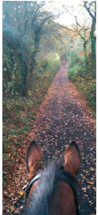
Blessing out on a hack at Botcheston.