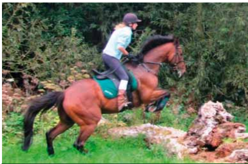
Circuit Dancer jumping his first log.