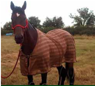
Bear at Hungarton Ride